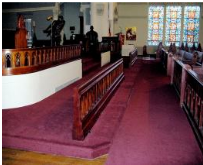
The nave of Christ Episcopal Church in La Crosse

Give rest, O Christ, to your servants with your saints, where sorrow and pain are no more